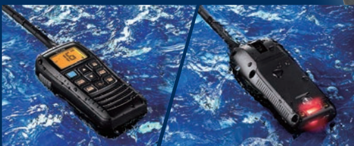
Float'n Flash function (front/back)

The radio floats with a flashing LED light to help you retrieve it from the water.